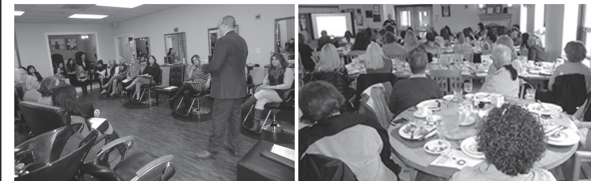
Left: MRC volunteers attended sessions at local salons, as well as a 'Train-the-Trainer' seminar to learn how to present the program themselves. Right: MRC volunteers attending the first talk at Nashoba Tech.

Volunteers from our unit joined local stylists and cosmetology students to attend Cut it Out lunchtime seminars at Nashoba Valley Technical High School in Westford, Serenity Salon in Tyngsboro, and Hair Illusions in Billerica. In addition, we either discussed the program with salon owners by phone, or personally delivered information packets and explained the